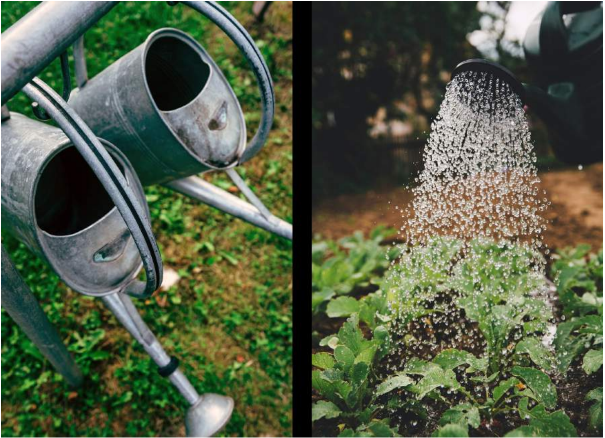
Image 006 – Photograph (L) by Markus Winkler and Photograph (R) by Markus Spiske

When producing a body of work that tells a photo story, include detail pictures, as this is very important.