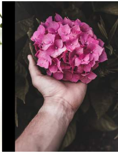
Image 003 – Photograph (L) by Eiliv-Sonas Acheron and Photograph (M) by Eco Warrior Princess and Photograph (R) by Alexander Andrews

Yet another photo storytelling technique is to set up a still life photo. Setting up a still life photo session can be a lot of fun. Why? You get to control every element of the story as it will appear in your photo versus the photojournalistic method of seeing and reacting to a given setting.