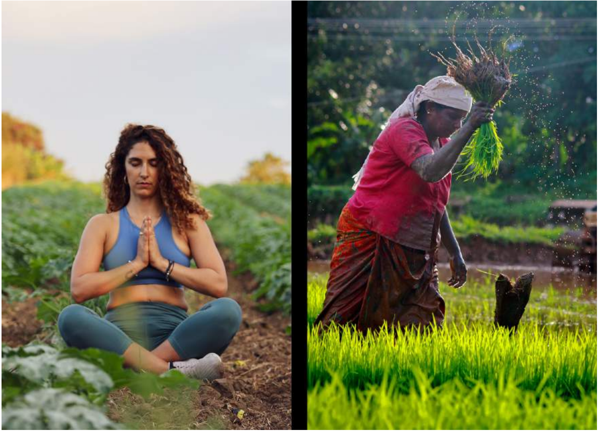
Image 005 – and

Depending on your creative thought process, it may be essential to keep the story real, or perhaps not.